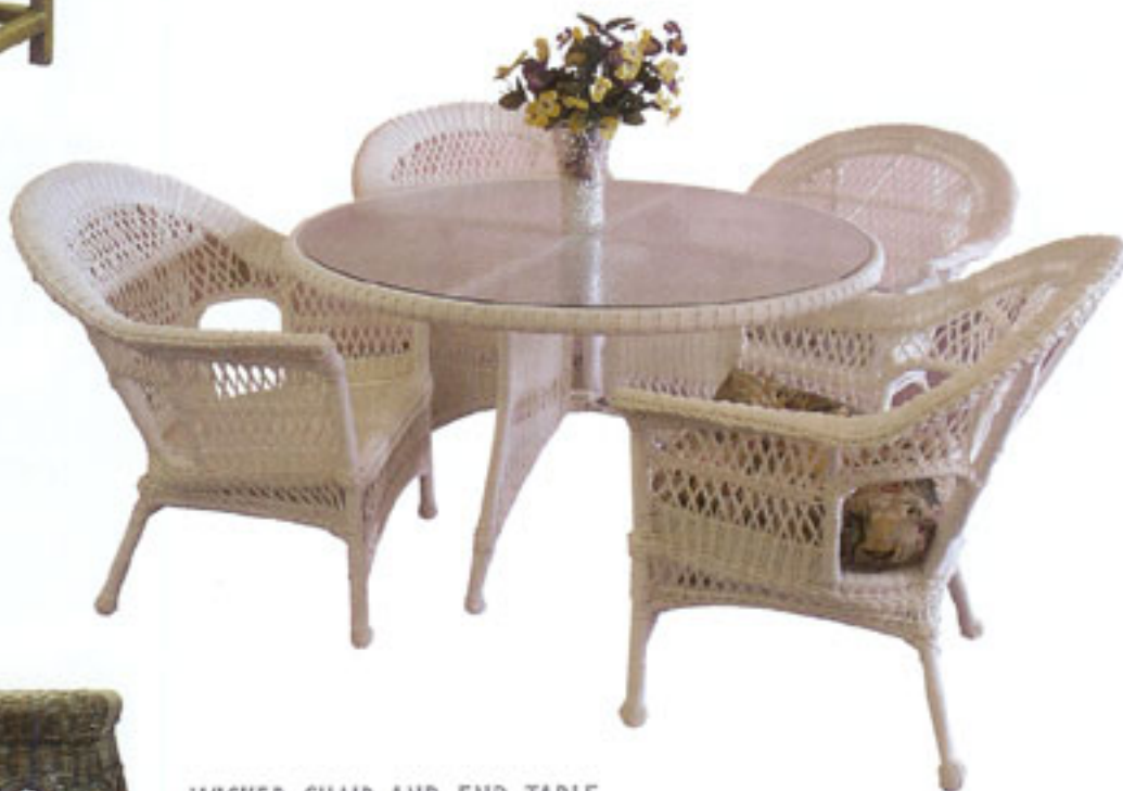
WICKER CHAIR AND END TABLE Sale Price: $89 and $59.95