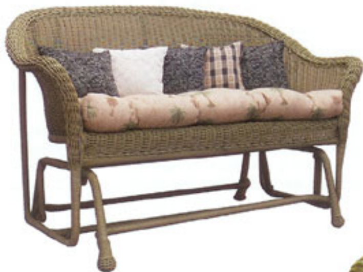
INDOOR/OUTDOOR GLIDER LOVESEAT 5 Colors Available Sale Price: $299

Need some inspiration for your porch or sunroom? Look no further than Wicker Etc. in Southaven. Choose from a large variety of styles and colors that will look great with any decor.