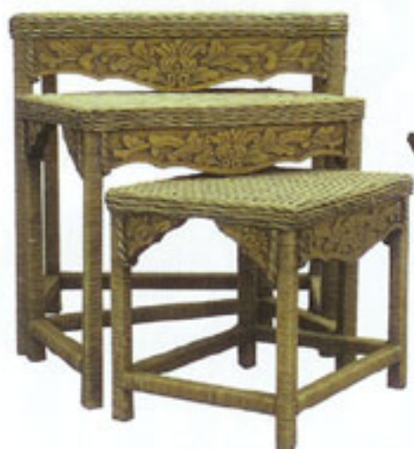
NESTING TABLES Sale Price: $259 - Set of Three