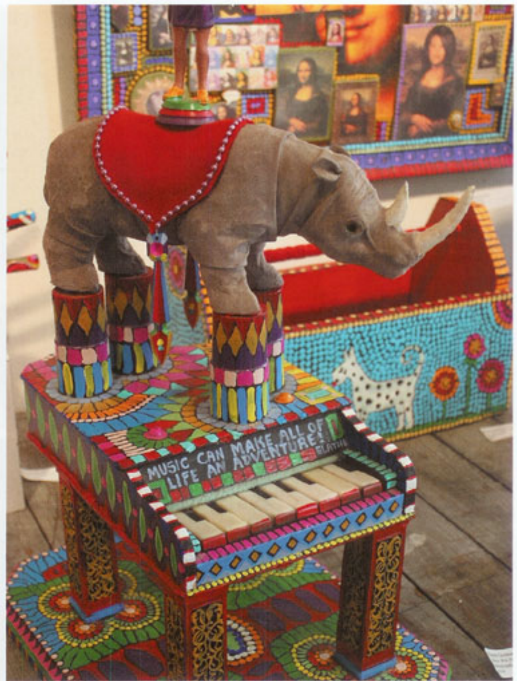
(Right) Mixed Media, Music with Rhino by Elayne Goodman

These attitudes breathe hope into the Mississippi artistic community, snuffing out the stuffy, snobby expectations one might have of an art gallery. By offering variety to the public, Southside may alleviate local artists' fears that their art isn't good because they lack traditional training.