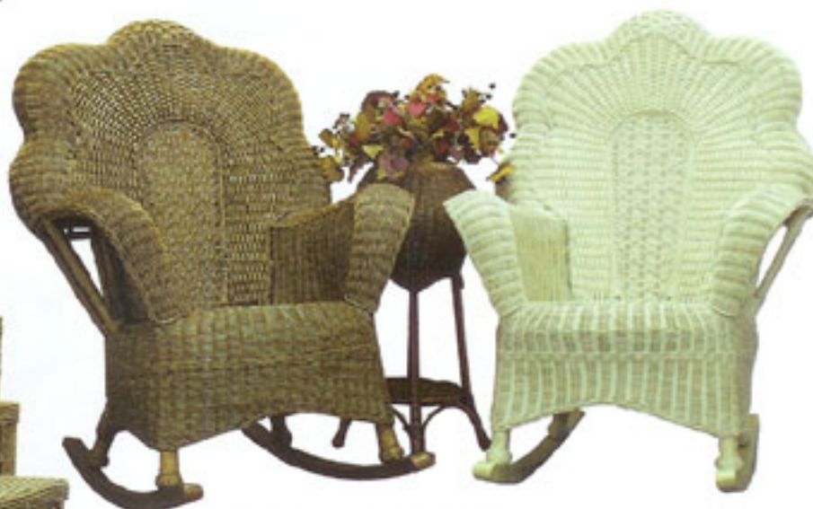
WICKER & RATTAN ROCKERS Sale Price: $249